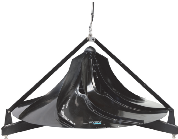
The HYPERDIVE ® -Mixer ready to go

After a short test run and a check of the direction of rotation the HYPERDIVE ® -Mixer can start operating without any further work. It is designed for permanent operation and does not require intensive maintenance work.