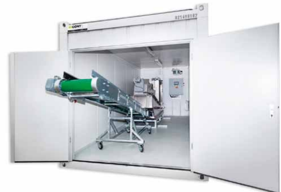
Built-in dewatering machine in the insulated container with belt conveyor