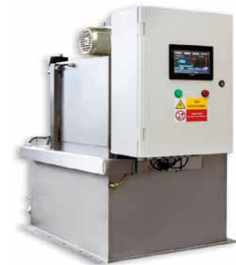
Automatic polymer station