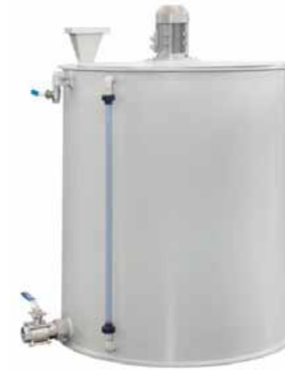
Manual polymer station